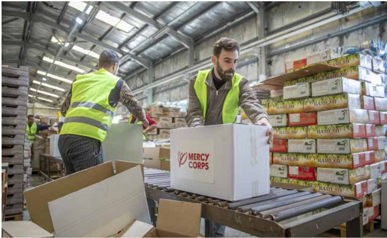
In Amman, Jordan, workers packed 1,300 food kits that were flown to Egypt and trucked across the border into Gaza for distribution.