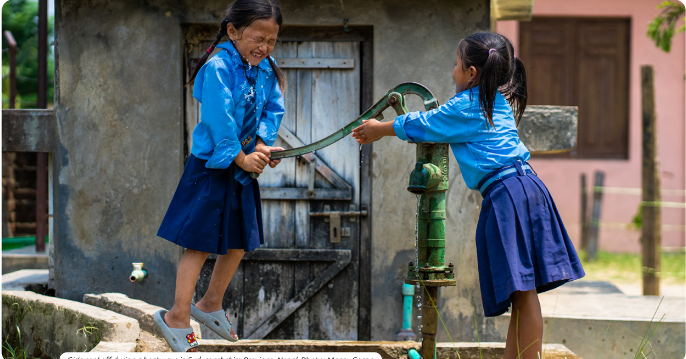
Girls cool off during a heatwave in Sudurpashchim Province, Nepal.

Achieving this is in the interest of all countries. It would restore trust in international climate negotiations, and give developing nations the support they need and have the right to under the UNFCCC. It would help put the whole world on a safer track towards a more stable climate and economy. And it would save lives, and restore some hope and dignity for communities around the world who are on the frontlines of the climate crisis.