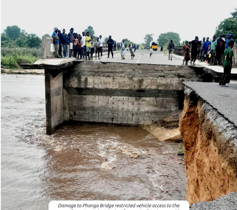
Damage to Phanga Bridge restricted vehicle access to the town of Nsanje, Malawi in the aftermath of Cyclone Freddy.

The legally binding 2015 Paris Agreement is of particular significance because it underpins the NCQG. Articles 2 and 9 of the Paris Agreement set out the core role of finance in driving climate action and create an obligation for developed countries to provide financial resources to developing countries. If countries are to interpret their treaty commitments in good faith, this obligation cannot be ignored. Indeed, as the second IHLEG report on climate finance put it: "Failure to generate investment and finance of the scale and nature required is to fail on Paris. The consequences would be devastating, particularly for the poorest people. Seizing the opportunity would unlock the growth story of the 21st century" (Bhattacharya et al., 2023).