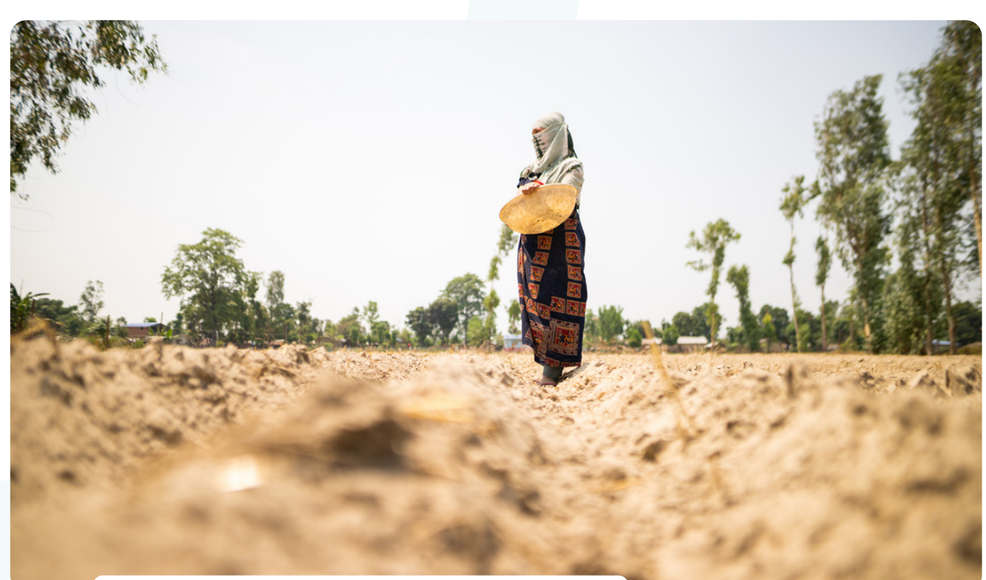
A farmer in Sudurpashchim Province, Nepal, pauses during a period of intense heat.