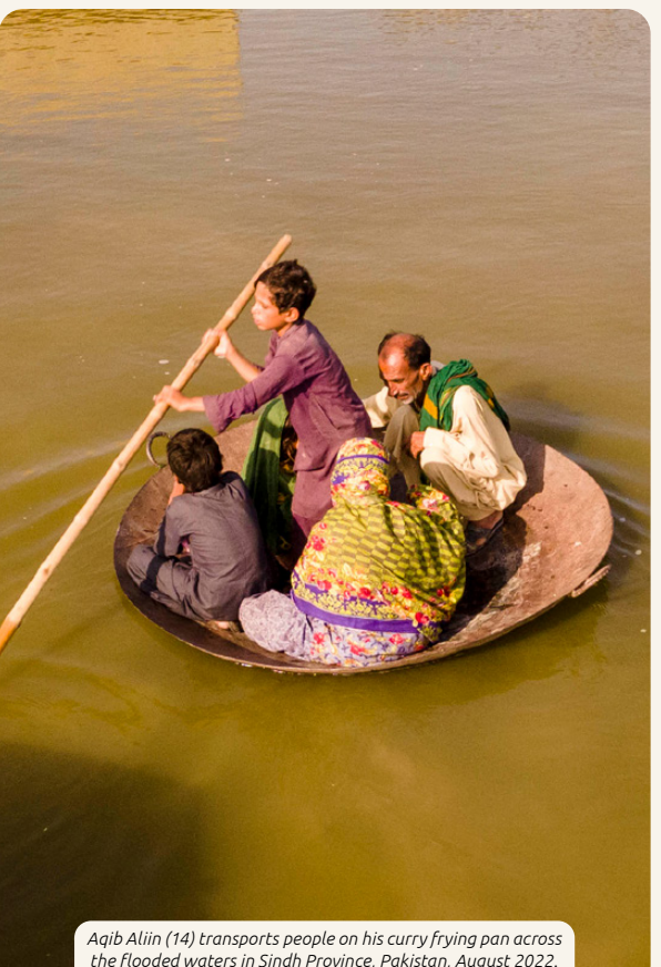
the flooded waters in Sindh Province, Pakistan, August 2022.

The Zurich Climate Resilience Alliance work supports vulnerable communities in three districts of Sindh Province which are highly prone to climate-induced disasters, notably flooding.