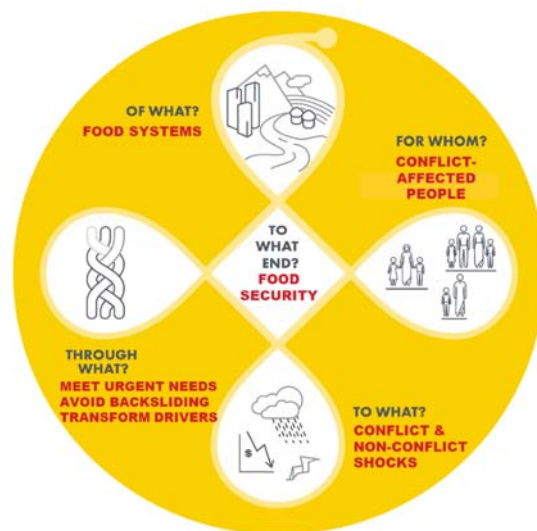
Figure 1: The Five Resilience Questions

What? What types of capacities, or resources and strategies, do people need to deploy in order to maintain their wellbeing in the face of shocks?