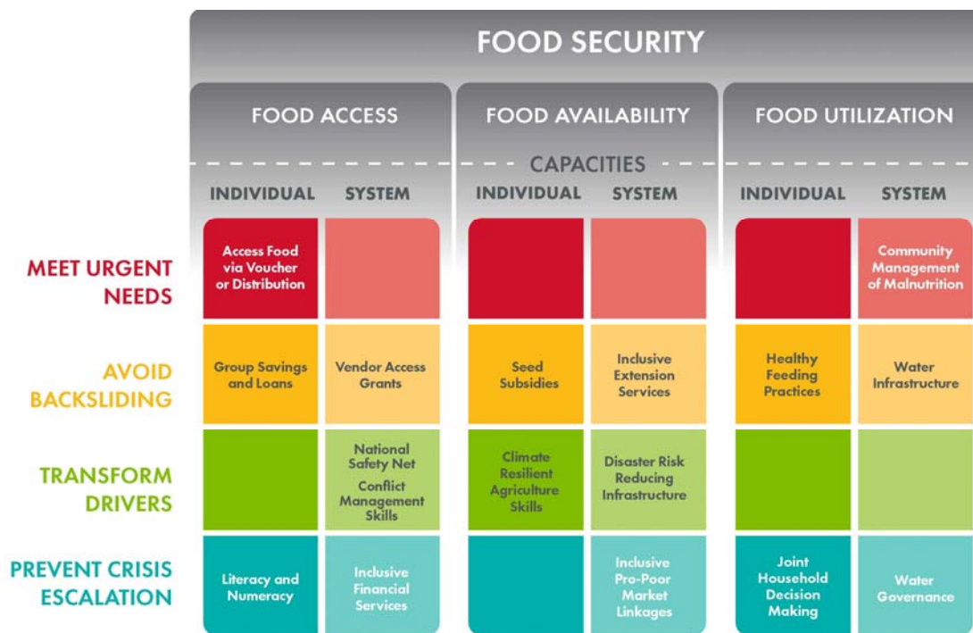
Figure 4: Example Multi-Year Strategy Capacity Framework

In 2019, Mercy Corps engaged in a multi-phased strategy process in South Sudan to articulate a path to resilient food security. Drawing from Mercy Corps' resilience, market systems and peacebuilding strategy development processes, the workshops used systems mapping and shock overlays similar to our Strategic Resilience Assessment process to identify resilience capacities to build food security. After, example activities were articulated, building on market systems and conflict analysis to identify potential intervention leverage points.