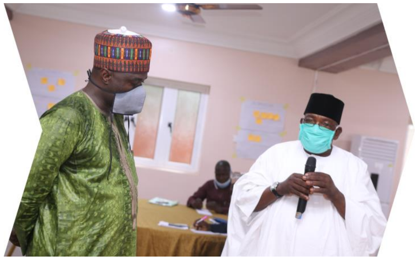
Kaduna, Nigeria