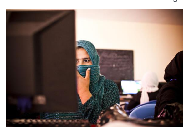
Helmand, Afghanistan

The widely discussed "infodemic"—in which people spread incorrect information unintentionally (misinformation) or intentionally (disinformation)—not only hampers public health outcomes, but also contributes to inflaming fears and misperceptions across groups, while deepening mistrust of government officials and health experts. Data collected by researchers at Princeton University indicates that COVID-19 disinformation is rife and covers a wide range of topics, from the nature and origins of the virus to unproven