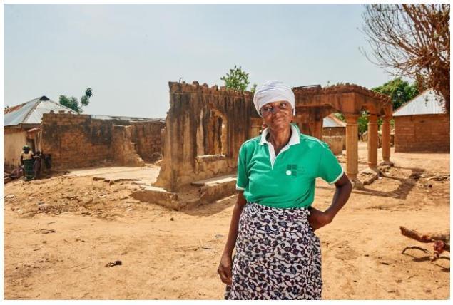
Tudun Adabu, Nigeria

Fragile social contracts are further eroding where COVID-19 is seen by local populations as an opportunity for corruption, incompetence, and exclusive or repressive behavior by governments. In some countries, the inability or unwillingness of the state to respond to citizens' needs, and the diminishing ability of civil society to hold authorities accountable, is deepening mistrust and legitimacy gaps and