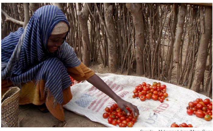
Somalia - Mohammed Jama/Mercy Corps

When significant areas of South Central Somalia were recovered from Al-Shabab4 control in 2012, Mercy Corps, TANGO International, and local partners took the opportunity to study how some households were better able to cope with effects of the drought and other major shocks. This provided a unique opportunity to understand how households that were largely unsupported by humanitarian assistance effectively managed the complex crisis, and to identify what conditions and capacities enabled them to do so. Mercy Corps' aim is to use the results to design interventions that will strengthen these factors, and generally contribute to more evidenced-based programming for resilience in complex crises.