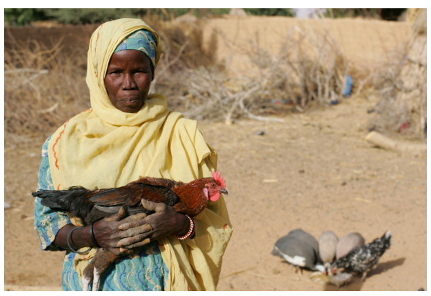
Niger

Conduct exit surveys with people leaving the fair to gain a better sense of participants' satisfaction and areas for improvement (Annex 36: Exit Survey template.) The two primary areas for evaluation are the fair's organization and the impact the fair had in relation to your program's objectives. Conduct exit surveys with a representative group of fair participants to measure the fair's organization. (For additional information on sampling, see the PDM section in Activity H: Redemption.) The impact the fair had on participants (as well as access/control and security concerns) must be measured later, when people have utilized the goods they purchased. For further guidance, see Activity H: Redemption.