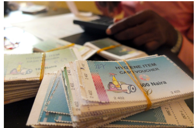
Nigeria – Mercy Corps

Commodity vouchers are the most restrictive voucher type, limiting participants' purchases to the specific goods or services listed on the voucher in the exact quantity specified (e.g., 5 kilos of rice). Commodity vouchers are useful if a program wants to restrict or direct the goods/services participants purchase (e.g., to address malnutrition by ensuring a specific intake of high-caloric foods). Commodity vouchers may also be helpful in areas with highly fluctuating prices, since they allow Mercy Corps to absorb the costs of those fluctuations (within reason) by listing the goods/services for exchange rather than a value.