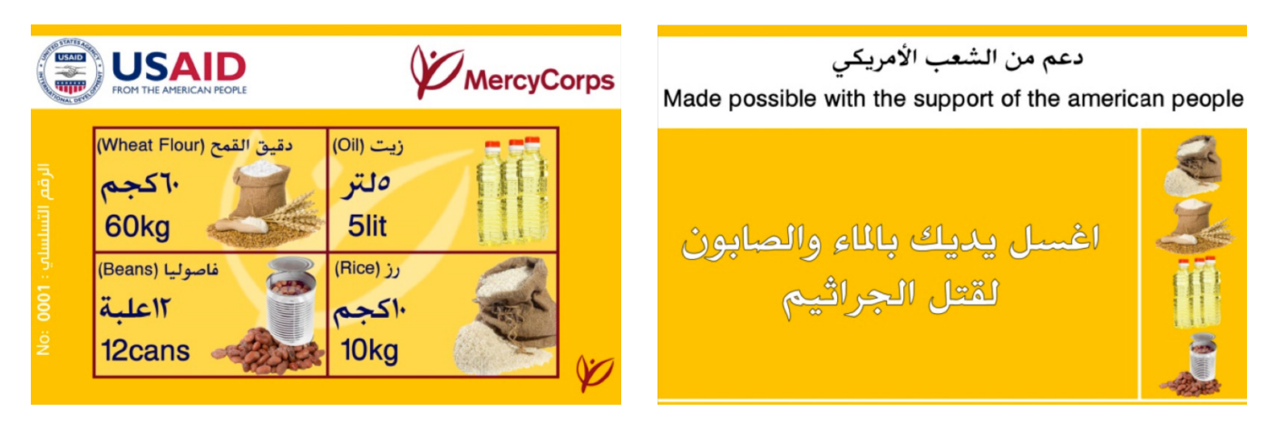
Commodity voucher example from MC Yemen's USAID-funded program TEFP.

The exact list of commodities/services for which the voucher may be exchanged. For illiterate/ innumerate program participants, photos and symbols may be used to represent the goods for which vouchers can be exchanged.