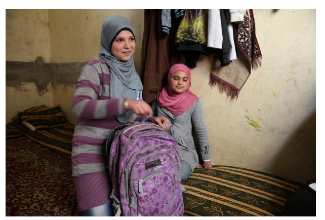
Lebanon

Ideally, 3-4 days prior to distribution, program participants should be notified of their distribution and the date/time assigned to them. (Oftentimes this is done through community representatives.) It is recommended to stagger distribution days at each distribution site. This benefits both participants and vendors by decreasing crowds, long lines and excessive wait times.