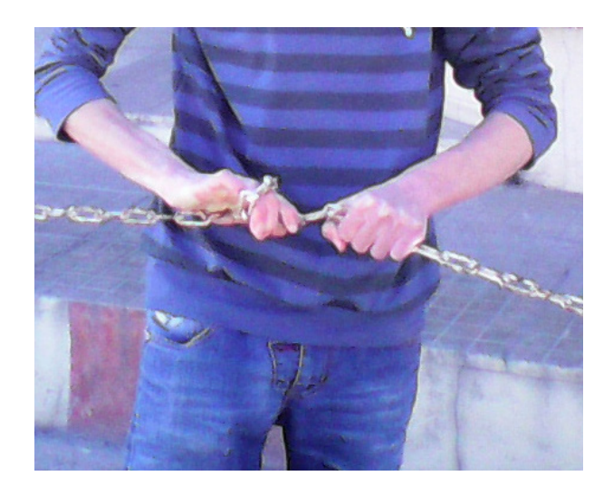
This is a picture of a chain, it symbolizes the blockades that forbid me from crossing the borders. I want to break free and go back.

Boys' Hopelessness: Syrian boys' photographs and subsequent discussions detailed how many of them are consumed by a sense of hopelessness. One Syrian boy aged 17 living in Lebanon took a photo of himself holding chains. When describing the photo he said, "This is a picture of a chain, it symbolizes the blockades that