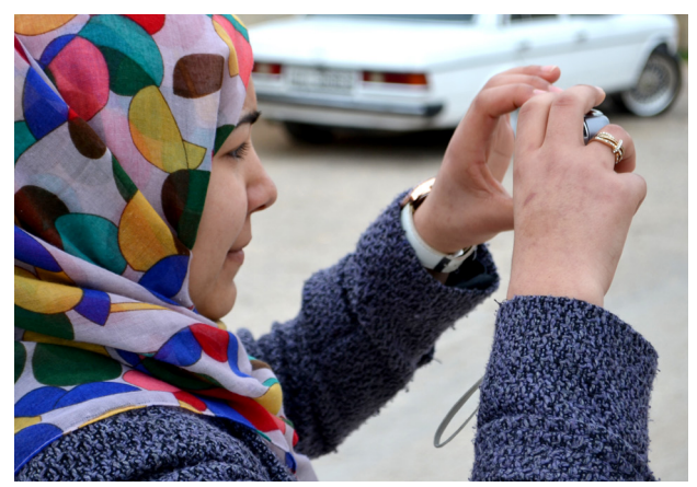
Female adolescent, Jordan

Syrian, Jordanian and Lebanese adolescents in Hartha, Saida and Baalbeck, and boys in Mafraq, resented the poor quality of education both in terms of teacher capacity and, for Syrians, curricular content. One Syrian adolescent commented, "Our history teacher taught us seven chapters in one class," revealing the potential drop in quality that results from accelerated education. Syrian adolescent boys in Jordan also reported being placed in school based on their age even though they had been out of school