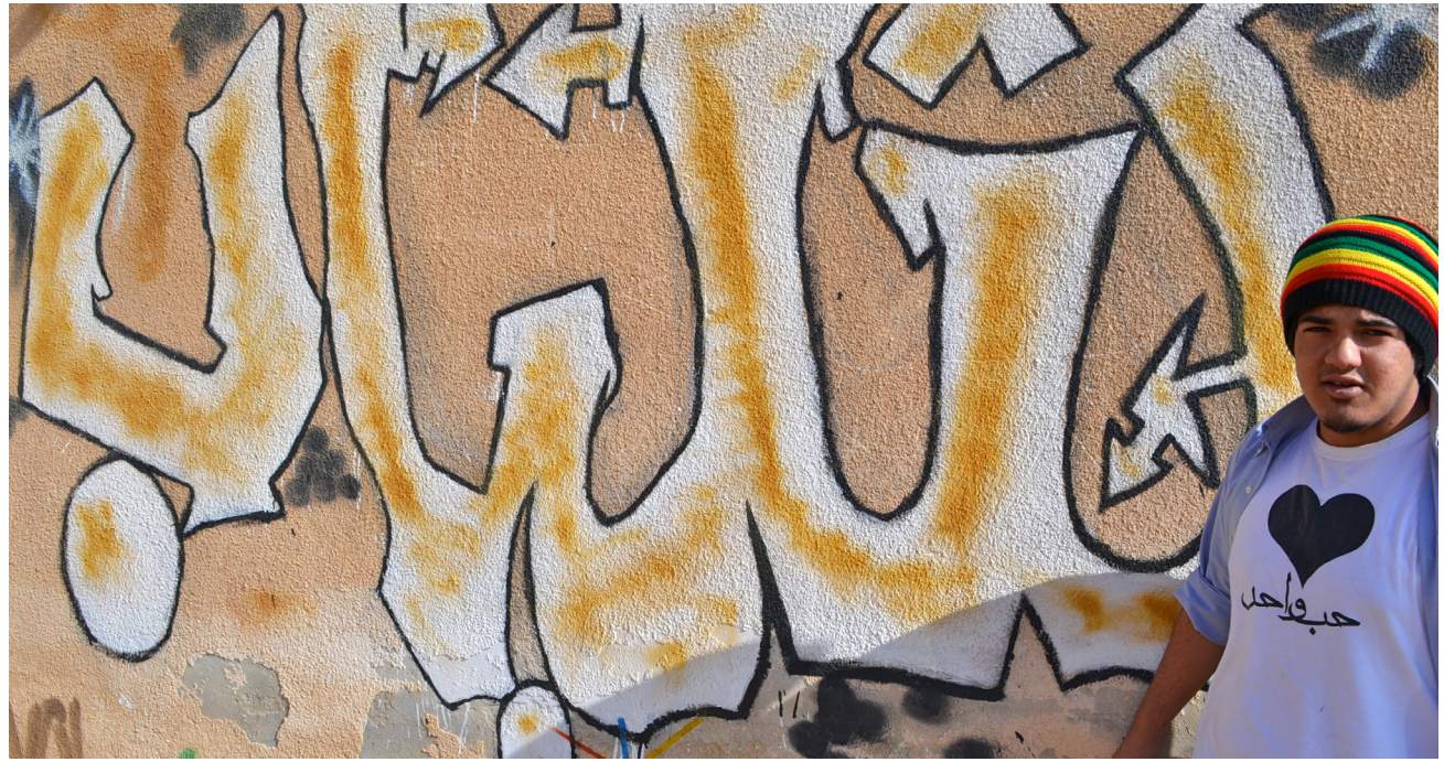
Graffiti reads "Youth" and artist's shirt reads "One Love"