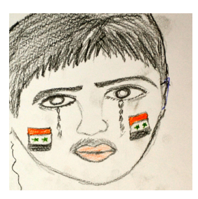
Female adolescent, Lebanon

All adolescent segments were keenly interested in broadening their social support networks and utilizing those networks for individual and collective expression through sport, art, photography, theatre, cooking and crafts and digital and social media. These expressive activities were described as an essential building block for establishing trust, building self-esteem and confidence and encouraging teamwork; all critical foundations for the community-involvement activities described below. These activities should