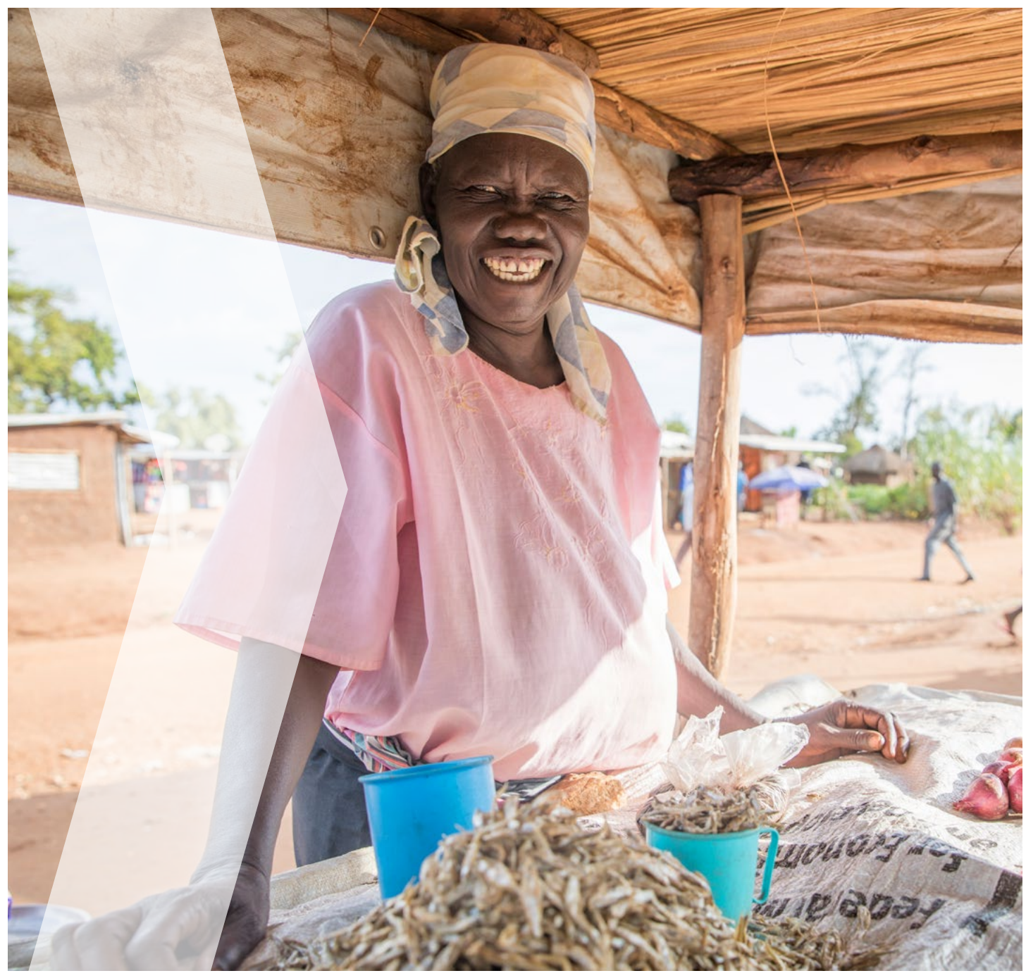
Ezra Millstein/Mercy Corps