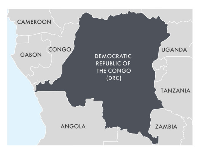
Figure 1: Map of the Democratic Republic of the Congo (DRC)

or incident-based and lacks the contextual framing vital to interpretation and crafting resilience-building program responses.<sup>8</sup> Mercy Corps' Crisis Analytics methodology—developed over the past five years and now deployed in complex crisis contexts such as Syria, Nigeria, and the Democratic Republic of Congo—explores the interconnected political, economic, social, technological, and cultural dynamics which drive crisis events, and maps crisis actors at institutional and individual levels. Crisis Analytics Teams (CATs) are deployed at the country level and connected to a global Crisis Analytics Unit.