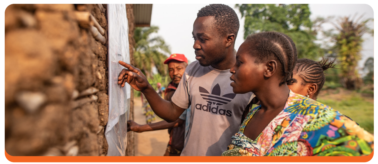
Men and women check a list for their names to see if they will receive cash assistance from Mercy Corps.

KEY TAKEAWAY: The ability of Crisis Analytics Teams to produce in-depth reports on evolving crisis dynamics, including the intentions and motives of armed groups, provides invaluable information that could be better utilized by peace and development actors to adjust their interventions before the full escalation of a crisis. Crisis analysis reports should be shared with a wide array of actors and donors that influence humanitarian, development, and peace programming decisions to increase the potential for collective action that builds resilience in addition to addressing acute needs. Consistent analysis and systematic reporting can raise awareness with communities, local government, and donors and depoliticize data sharing.