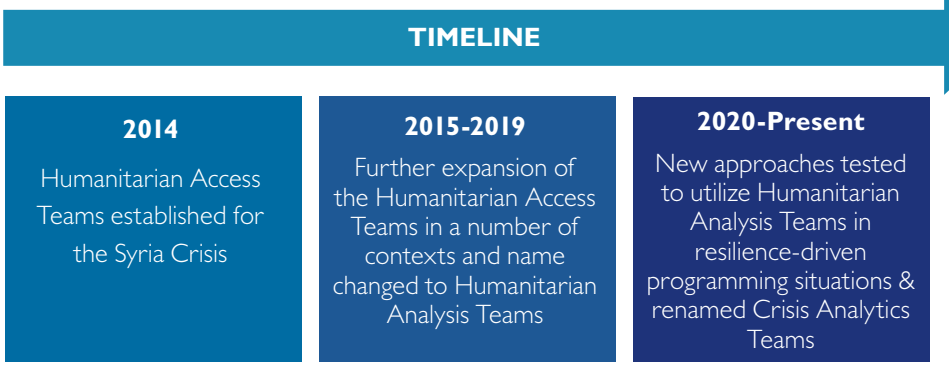
Figure 2: Evolution of Crisis Analytics Teams

areas of a crisis, and are connected to a diverse network of information sources across different crisis actors, sectors, and locations. CATs remain in constant contact with these information sources, which can include principal actors at the highest levels of the main rival factions or groups, de facto authorities, and political and military actors garnering the most nuanced and up-to-date information available. The team also nurtures key contacts with the economic and business sector, as well as operational humanitarian and development agencies in the UN/multilateral system and NGO spheres. By maintaining an active conversation with such a diverse network, the analysts are able to gain multiple insights into factional perspectives on key issues, triangulate information, and synthesize the feedback into actionable insights and predictive