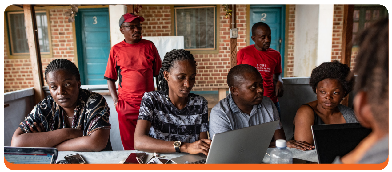
Mercy Corps team members hold a meeting in the evening, preparing for a cash distribution for people displaced by violence.

KEY TAKEAWAY: Continuous and granular analysis of conflict and displacement dynamics in protracted crises can provide a clear picture of where it is possible—and often necessary—for humanitarian investments to go beyond meeting immediate needs, and take a medium-term approach to programming that lays the foundation for resilience. This analysis in the DRC supported teams to not only adjust their own interventions to strengthen resilience capacities among displaced populations through livelihoods and markets support, but the information helped influence humanitarian donors around what type of investments could help communities move beyond crisis and build resilience as well.