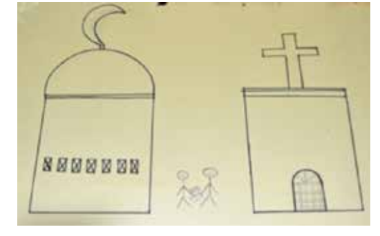
Female adolescent, Lebanon

community. Multiple drawings depicted a desire for greater religious acceptance. A 15-year-old Lebanese boy described his drawing of a tree saying, "This tree represents me. There are forces that want to knock me down like the wind shown here. While these forces might blow off my leaves, they will never knock me down." When asked by the facilitator what forces the wind might represent in the picture, a number of boys mentioned sectarianism. In light of the rising presence of extremist groups in North Lebanon and the Bekaa Valley, it is likely that these sectarian tensions will continue to rise.