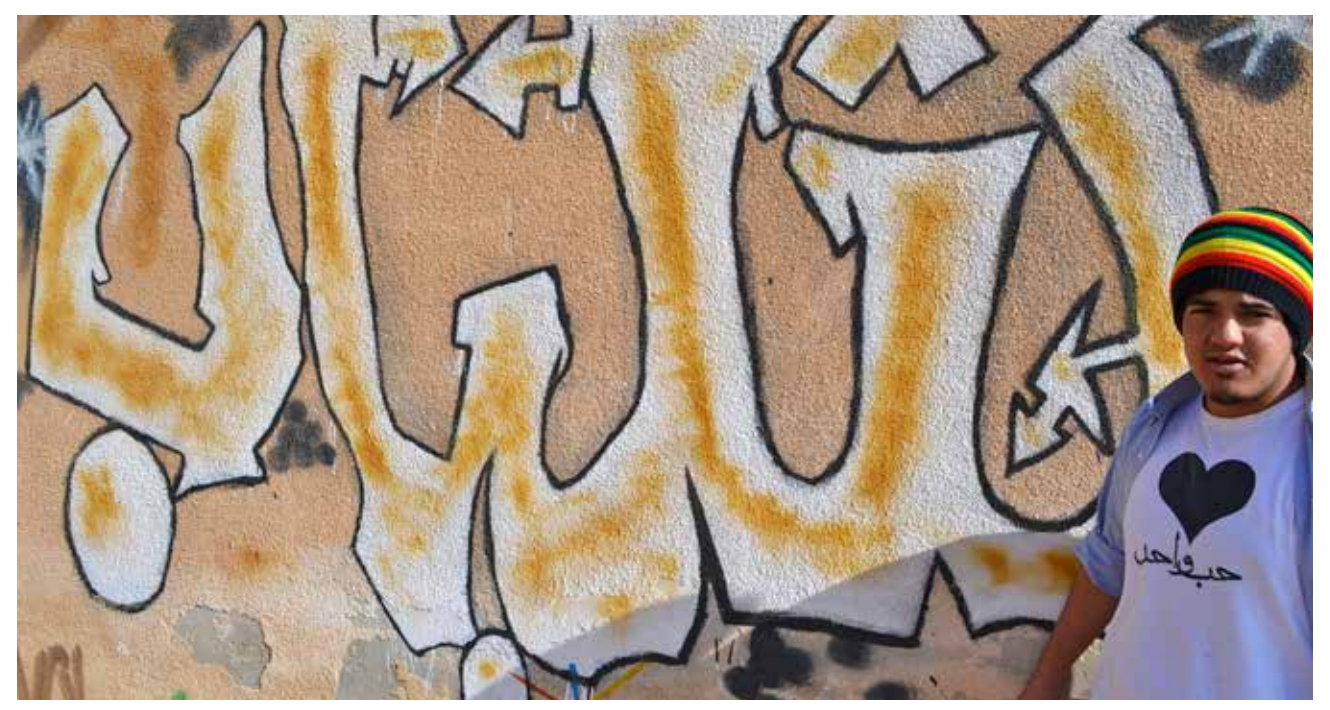
Graffiti reads "Youth" and artist's shirt reads "One Love"