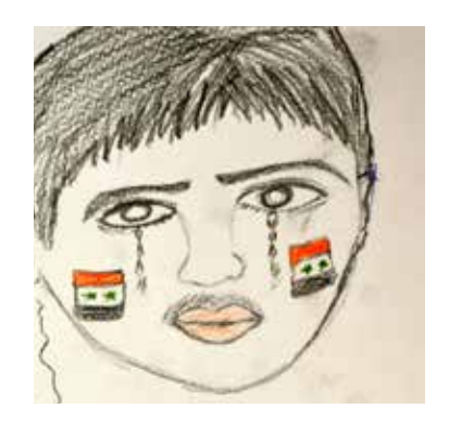
Female adolescent, Lebanon

All adolescent segments were keenly interested in broadening their social support networks and utilizing those networks for individual and collective expression through sport, art, photography, theatre, cooking and crafts and digital and social media. These expressive activities were described as an essential building block for establishing trust, building self-esteem and confidence and encouraging teamwork; all critical foundations for the community-involvement activities described below. These activities should