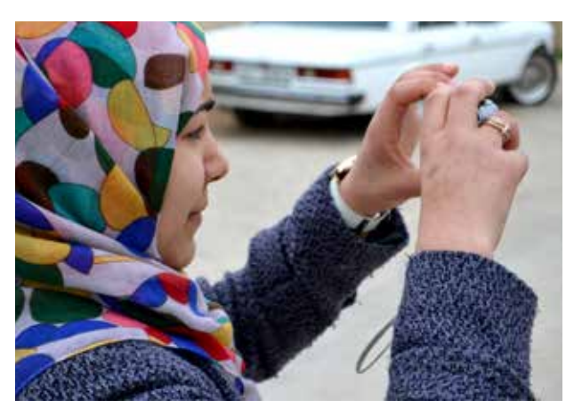
Female adolescent, Jordan

Syrian, Jordanian and Lebanese adolescents in Hartha, Saida and Baalbeck, and boys in Mafraq, resented the poor quality of education both in terms of teacher capacity and, for Syrians, curricular content. One Syrian adolescent commented, "Our history teacher taught us seven chapters in one class," revealing the potential drop in quality that results from accelerated education. Syrian adolescent boys in Jordan also reported being placed in school based on their age even though they had been out of school