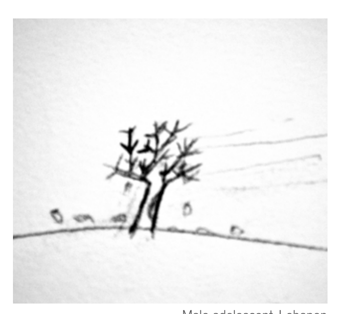
Male adolescent, Lebanon

Youssef's tree serves as a powerful analogy that guides how Mercy Corps approaches programming for adolescents. It is helpful, as Youssef's tree and quote represent, to approach program design by detailing the "wind," what we refer to as the barriers that impede adolescents from developing into peaceful and productive young adults, as well as the "soil and roots," what we refer to as the enablers that promote adolescent development.