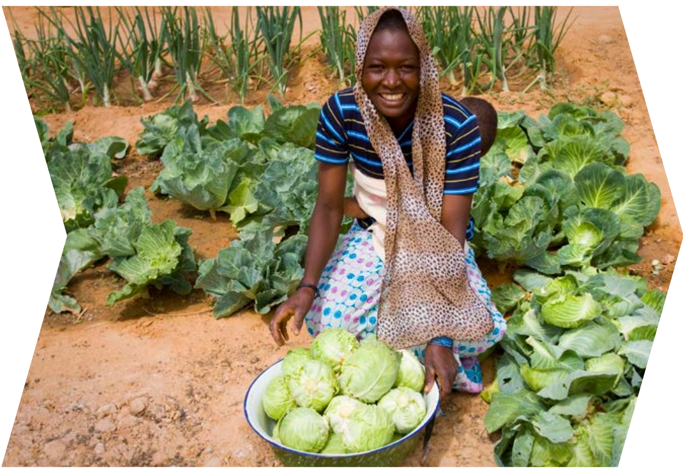
Mercy Corps: C. Nelson / Niger 2012