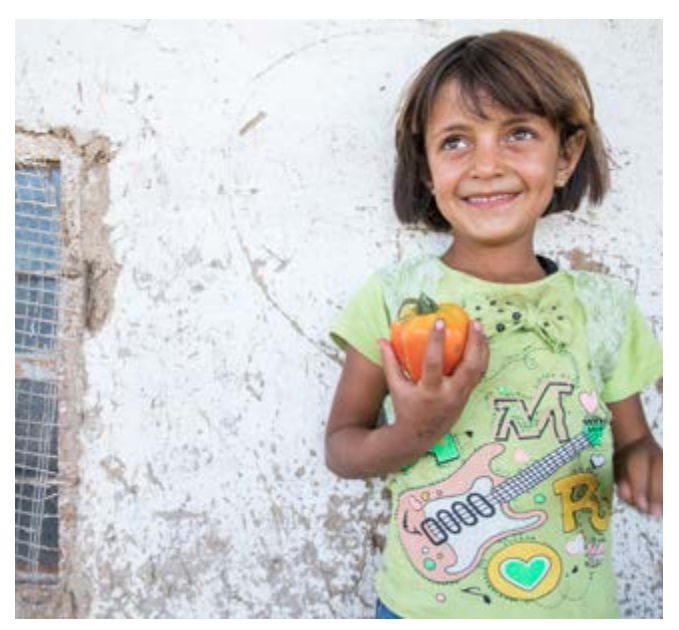
Mercy Corps: E. Millstein / Syria 2017