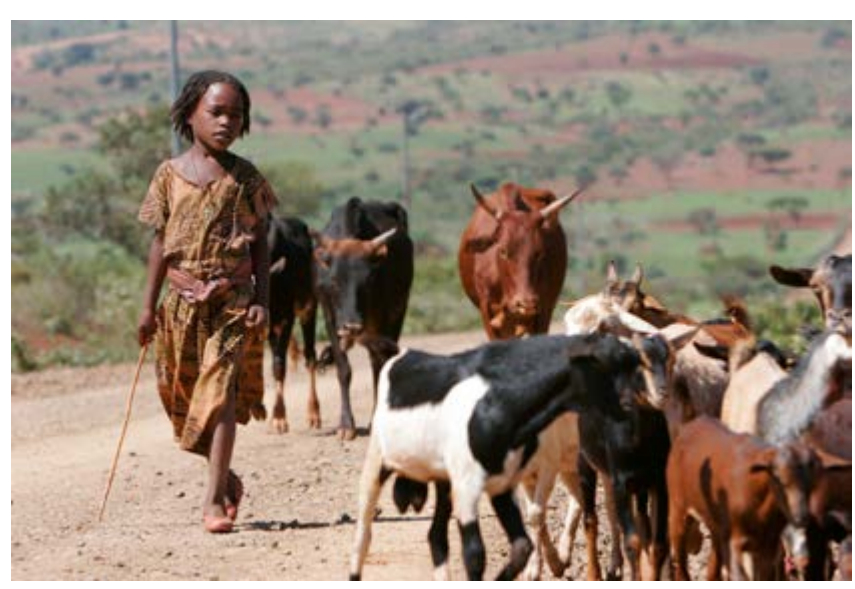
Mercy Corps: G. Bugbee / Ethiopia 200: